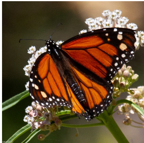
Native monarch butterfly on narrow leaf milkweed, Asclepias fascicularis. Spotted at Lake Cunningham Park habitat restoration area. Learn more about habitat restoration on page 7