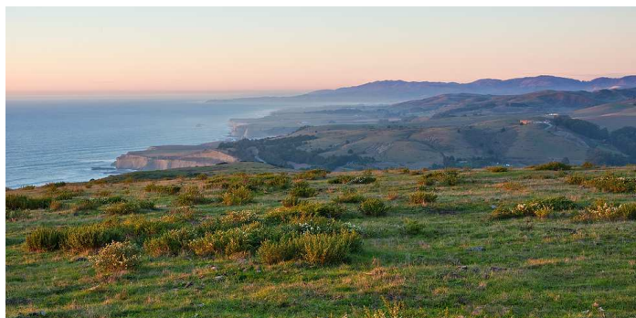
Toto Ranch between Pescadero and Half Moon Bay, now part of the Tunitas Creek Open Space Preserve of MROSD

At our April Board meeting, our Chapter voted to endorse Measure AA, which is a bond measure to fund top priority projects for the Midpeninsula Regional Open Space District. Many of our Chapter field trips explore MROSD lands and we want maintain the environmental quality of these lands while at the same time providing public access to the lands in an ecologically compatible way.