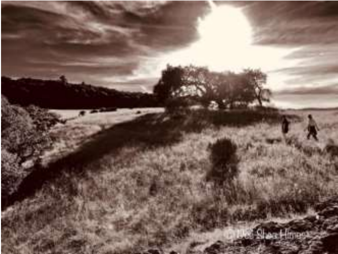
Dee Shea Himes

Bring a hat, sunscreen, water and snacks. Wear sturdy footwear. Bring a hand lens or loupe if you have one.