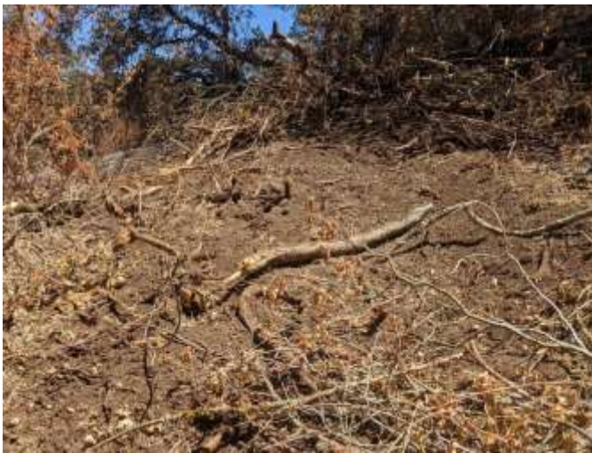
Dozer line through Dirca habitat. The bulldozing prevented the June Edgewood fire from reaching the other half of the Dirca colony, but was very destructive to the plants in its path.