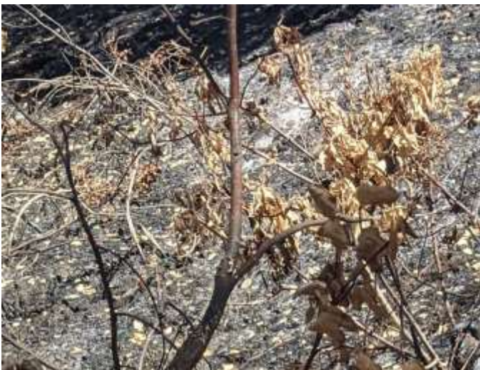
Dirca burned by the June Edgewood fire

A visual survey of the fire effects by Paul Heiple and our Chapter's Edgewood weeders revealed that about half of the Dirca colony was saved from burning by the bulldozer line plowed through the center of the population. While preserving these plants from burning, the dozer line was very destructive to the plants in its path. Western leatherwood is rhizomatous, so plants that were burned may be able to re-sprout from rhizomes.