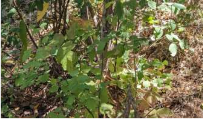
Unburned Western leatherwood ( Dirca occidentalis ) at Edgewood