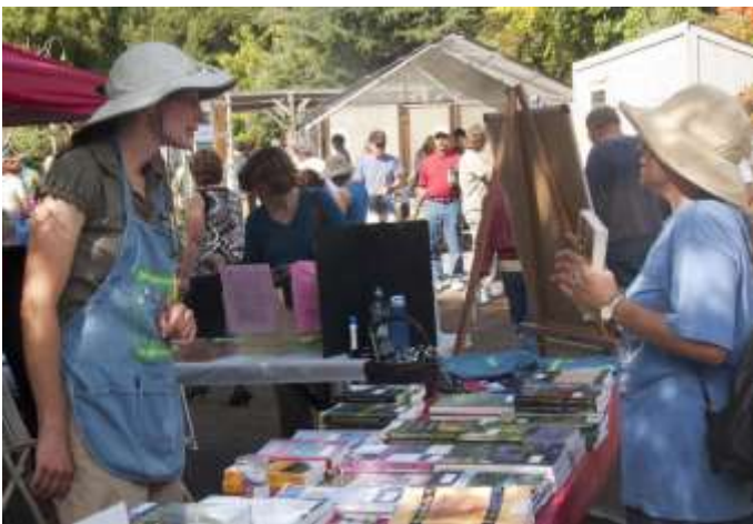
Book sale table at CNPS-SCV Nursery during our October 2009 Native Plant Sale

In honor of our Chapter's 50th anniversary, we are offering a special package for people who join CNPS during our celebration on October 8. New members will get a 50% discount – only $25 to join CNPS for a year! They will also receive a special welcoming package to our Chapter while supplies last – a 50th Anniversary pin, CNPS SCV water bottle and a Chapter T-shirt! (T-shirt background color is navy blue.)