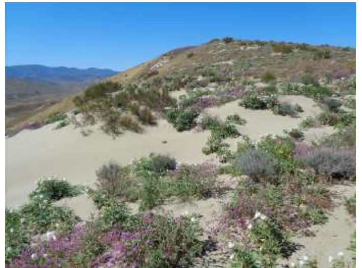
Monverro Dunes in the San Joaquin Desert of California

The President does not do the work alone. Our Chapter has a long history of great teamwork and camaraderie. The Vice President, Recording Secretary, Treasurer, and Board Members help the President manage the Chapter. The Vice President can assist with any of the President's responsibilities.