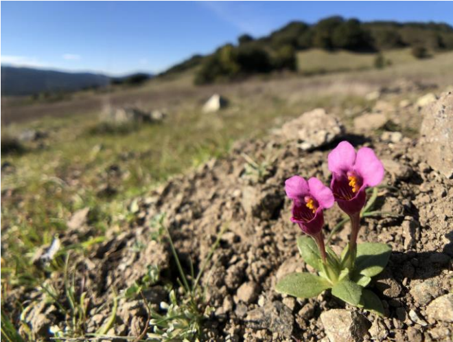
Dee Shea Himes

Dee used an ōlloclip® Super Wide Angle lens, to capture a closeup of mouse ears ( Diplacus douglasii ) in its endemic habitat, yet show the distant ecology