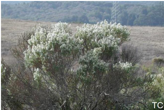
Coyote brush.

Plant habitats are not stable. Over many years, plant colonies extend into areas previously held by other plants. There is a natural order to how these invasions happen, called succession. Although we can't watch the whole show, we can see succession in progress.