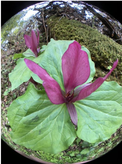
Dee Shea Himes

Using Olloclip fish-eye lens on Giant Trillium ( Trillium chloropetalum ).